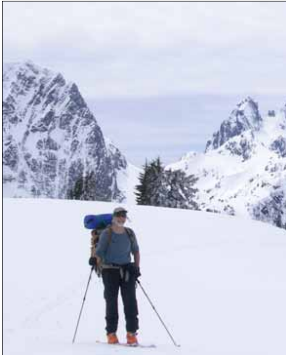
Skier near Tanks Lake, on Foss traverse.