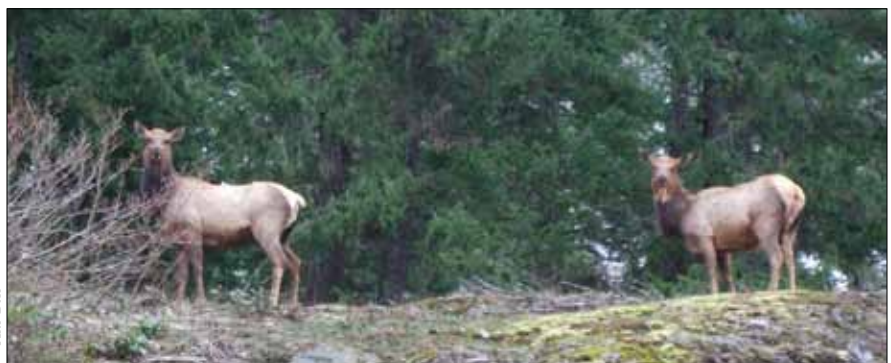
Elk heading for summer pastures.

Environmentally-oriented organizations including ALPS made the case for alternatives that reduce the ORV footprint to protect resources and achieve a sustainable, balanced recreation plan that is within the long-range capability of the USFS to manage. At the other extreme, there is likely to be an alternative that is very responsive to the desires of the ORV community for an even more extensive motorized trail system than present that would further threaten the integrity of roadless areas and wilderness boundaries. We also expect an alternative that is close to the status quo with its current unmanageable problems. There will be an OWNF "preferred" alternative, but we will not speculate what that will be at this time. The interdisciplinary team now expects to complete the DEIS and make it public this coming fall of 2010. The issuance of the DEIS will start the most crucial time for public engagement to make the case for adopting a strong, environmentally sound and recreationally balanced alternative. ALPS wants to see a successful implementation of the Travel Management Plan that actually achieves its goal to significantly reduce the threat of ORVs to the National Forest. ■