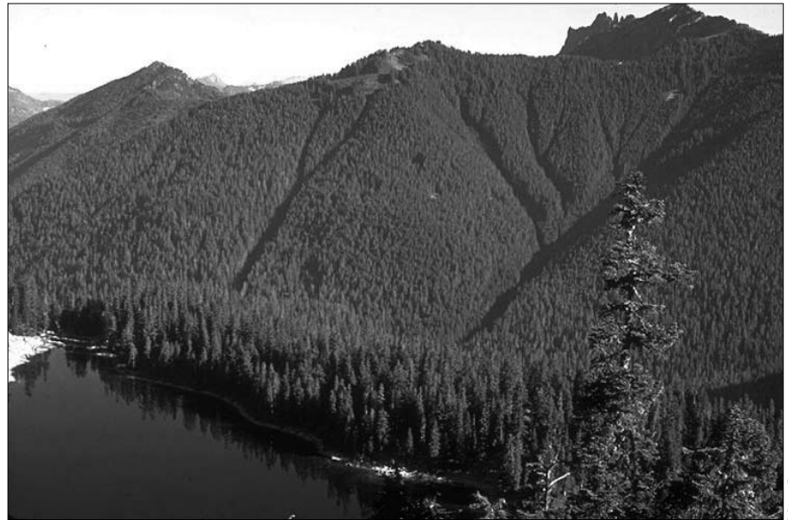
Sunset Lake, in the center of the new Wild Sky Wilderness, with old growth forests in the valley of Trout Creek below.

Thanks to some unusual geography, salmon and steelhead can ascend and spawn in the North Fork Skykomish to within five miles of the Cascade crest. One or both banks of the North Fork